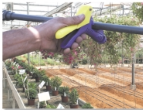
Suitable for holing hanging pipe-lines in greenhouses. Model UP-3

A special model that carries an insertion pin instead of a cutting blade for inserting connector components, especially suited for work with hanging pipe-lines in greenhouses.